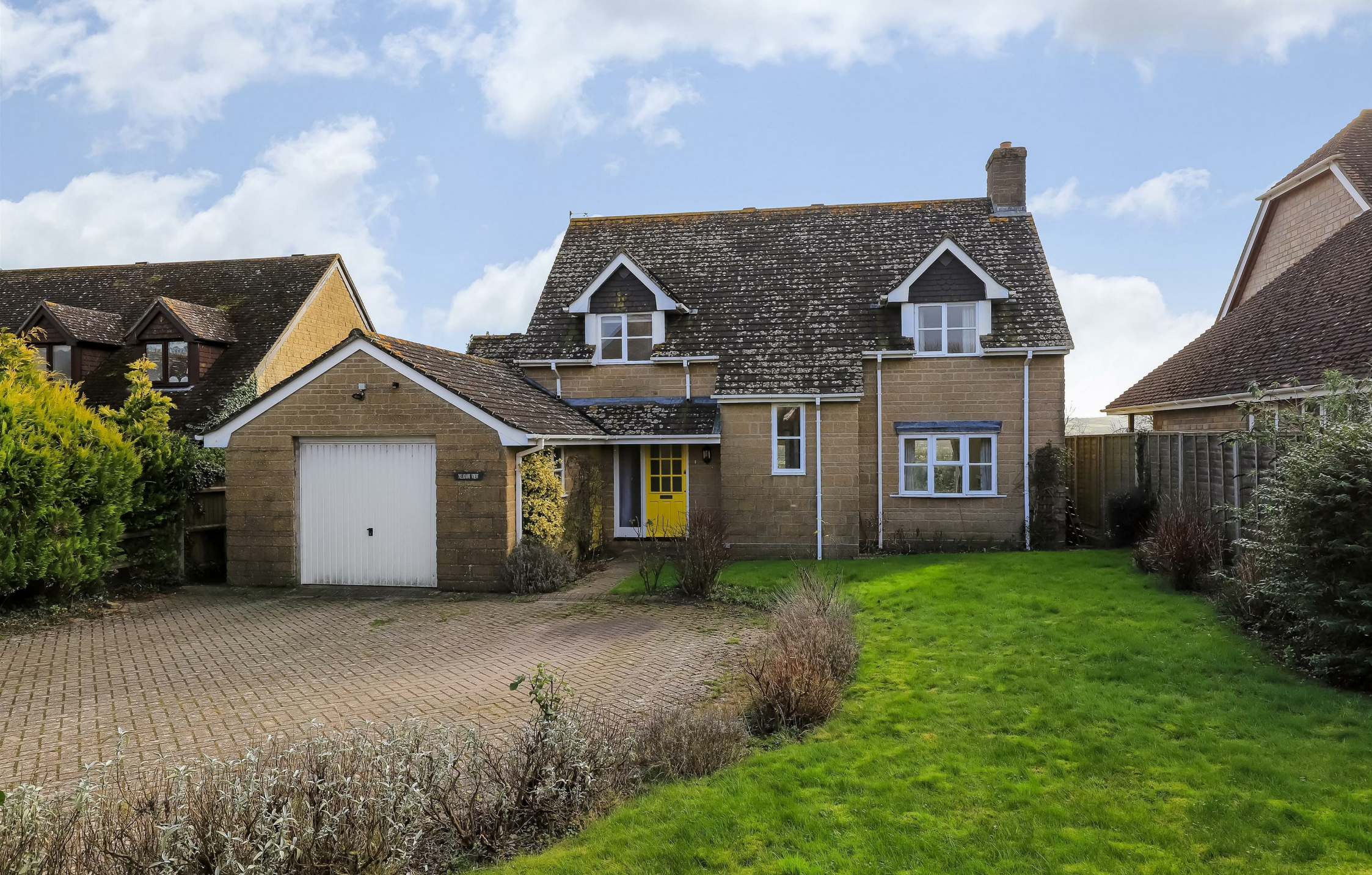
Meadow View, Wonston, Hazelbury Bryan